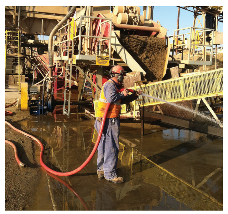
Vulcan continually trains its employees on safety. Personal Protective Equipment (PPE) are required to safeguard employees.

Vulcan recognizes that mining at Black Point is an interim use of Guysborough's land. Vulcan keeps the site's end use in mind, and realizes that responsible land management is key to sustaining the Company's success. The future use of each property represents significant value to the community, and when possible, Vulcan engages the local community in the evaluation of post-mining options. Vulcan is renowned for its award-winning environmental stewardship. For example, Vulcan has been recognized by the State of California Department of Conservation Office of Mine Reclamation with the Award of Excellence in Reclamation for its natural restoration of its River Rock project in Fresno, California. An initial reclamation plan describing progressive restoration and revegetation will be included in the Environmental Assessment report, with more detail required at the permitting phases following the Environmental Assessment.