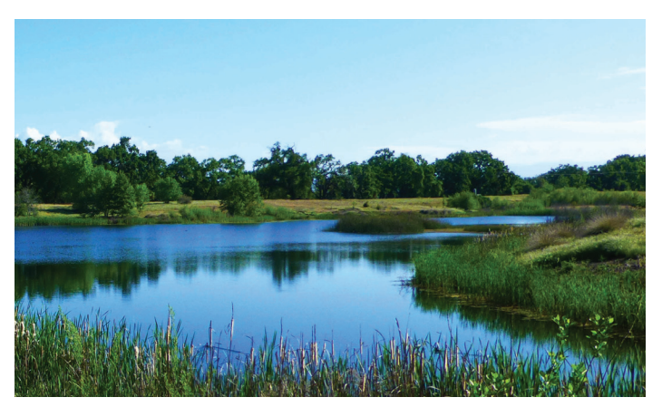
Rank Island at Vulcan's River Rock Facility in Fresno, California.

All finished aggregate will be sent to markets by ocean-going ship using the marine terminal to be built adjacent to the quarry site. Haul trucks are not anticipated to be traveling on local roads, including Highway #16. It is anticipated that some equipment will be delivered to the site by truck during the construction phase, and there will be increased traffic on the road as local workers will use the Highway to access the site.