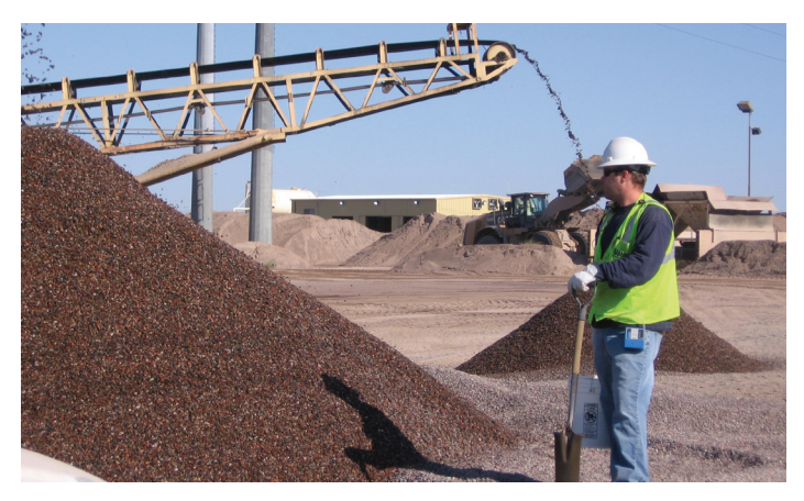
Material being moved by conveyor belt to stockpile.

Crystalline silica (basically fine sand) is an abundant naturally occurring mineral that is widely present throughout the earth in soil and rock formations. It is also found in a wide variety of consumer products and applications including pharmaceuticals, household cleaners, cosmetics, play sand, golf courses and ball fields. The rock that will be mined and processed at Black Point is granite, which contains silica. However, Vulcan will be continually monitoring the dust levels at the site, and the dust control measures that Vulcan will employ are very effective at controlling air emissions. Vulcan has been nationally recognized by the U.S. Department of Labor for its industry-leading programs in protecting employee health from any respiratory issues associated with producing construction materials. The low levels of crystalline silica that may result from plant operations will not have an impact on neighbours or employees.