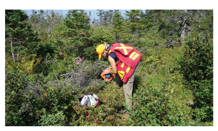
Project representative on site collecting baseline environmental data.

Yes, mining and quarrying jobs are among the safest of all industrial sectors. A 2014 report by the Workplace Safety and Insurance Board noted that mining has a lower lost time injury rate than many industrial sectors including agriculture, construction, forestry, health care, municipal government, automotive and transportation. Additionally, Vulcan has a strong commitment to worker safety and has an exemplary health and safety record at its more than 340 operations in the U.S., Mexico and the Bahamas. Vulcan has received many awards for its safety record and programs.